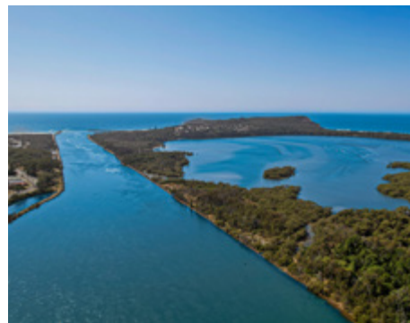
The Camden Haven estuary.