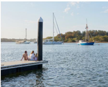
The Hastings River estuary.

The CMP covers coastal and estuarine areas (where a river meets the ocean) across our region.