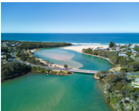
Lake Cathie, Lake Innes and Bonny Hills estuaries.