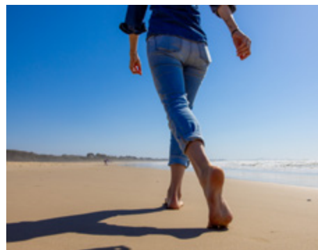
Beaches, dunes, cliffs and headlands along the open coastline.